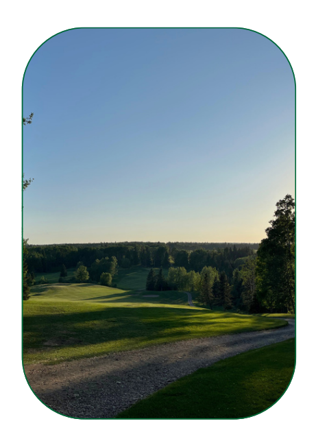
Yearly Cart Pass- One seat: $750.00