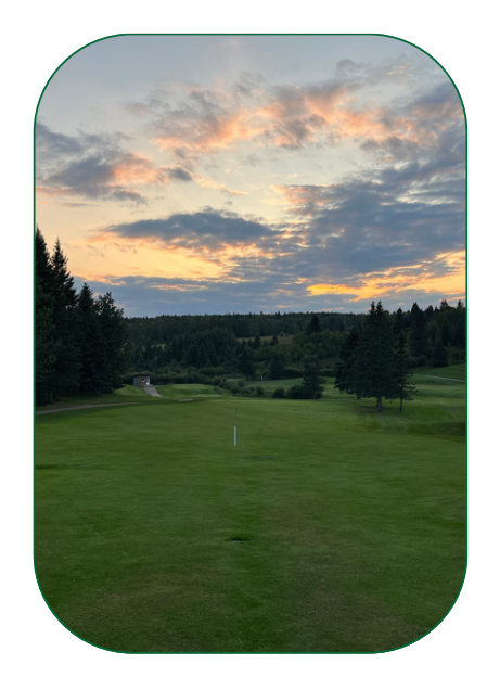
Yearly Push Cart Storage: $100.00

Yearly Locker & Locker Room Access: $50.00