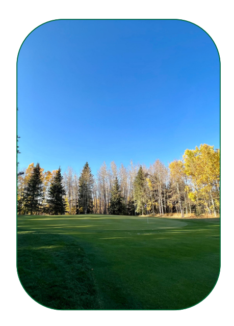
MINI TOURNAMENTS & OUTINGS