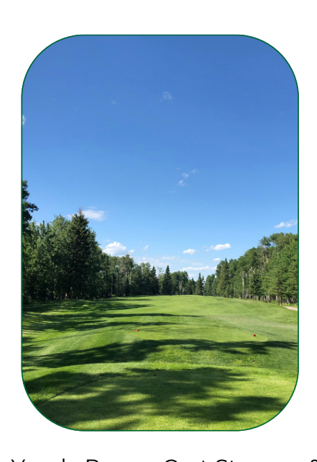
Yearly Power Cart Storage & Trail Fee: $999.00 Two seats- 18 Stalls Available

Yearly Locker & Locker Room Access: $50.00