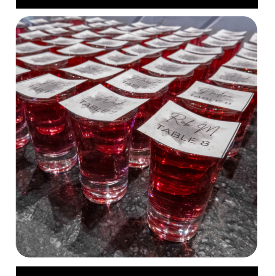
FIND YOUR SEAT